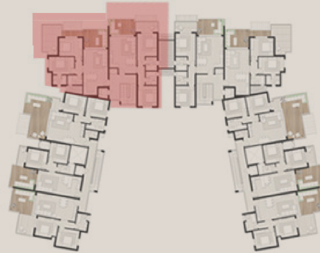
Lofts & Duplexes