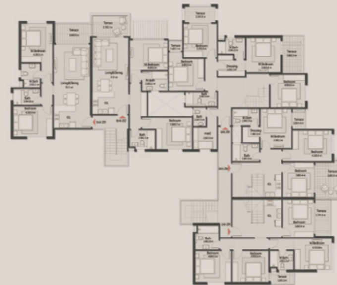
Roof Floor Plan