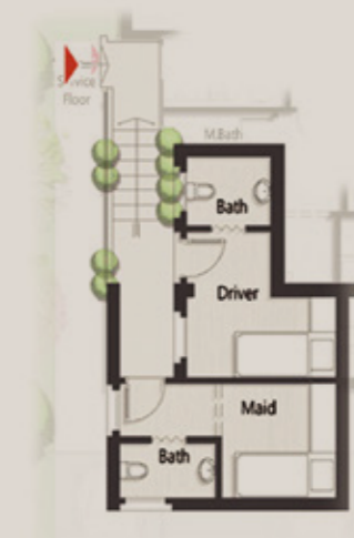
Service Floor Plan